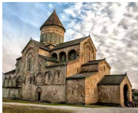
Metekhi Church

This itinerary is subject to change at the discretion of The Metropolitan Museum of Art and Arrangements Abroad. For complete details, please carefully read the terms and conditions at www.arrangementsabroad.com/terms .