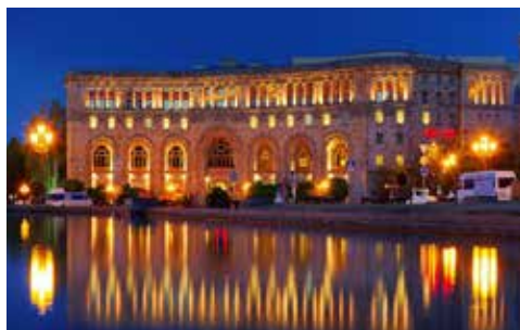
Armenia Marriott Hotel Yerevan

Centrally located on Republic Square, the Marriott Yerevan is a sophisticated modern hotel behind an elegantly carved stone façade. On-property amenities include soundproof rooms, three restaurants serving international cuisine, and a spa with a beauty salon and fitness center.